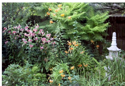
Carol Bales' "Lilies in the Landscape or Garden," won Class P-2.